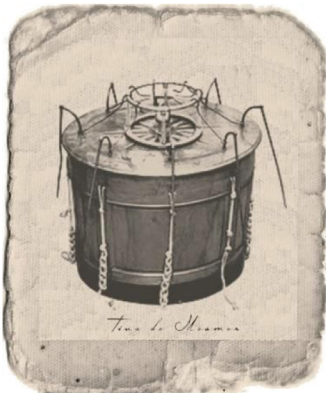
1 Baquet circa 1778 developed by Franz Anton Mesmer